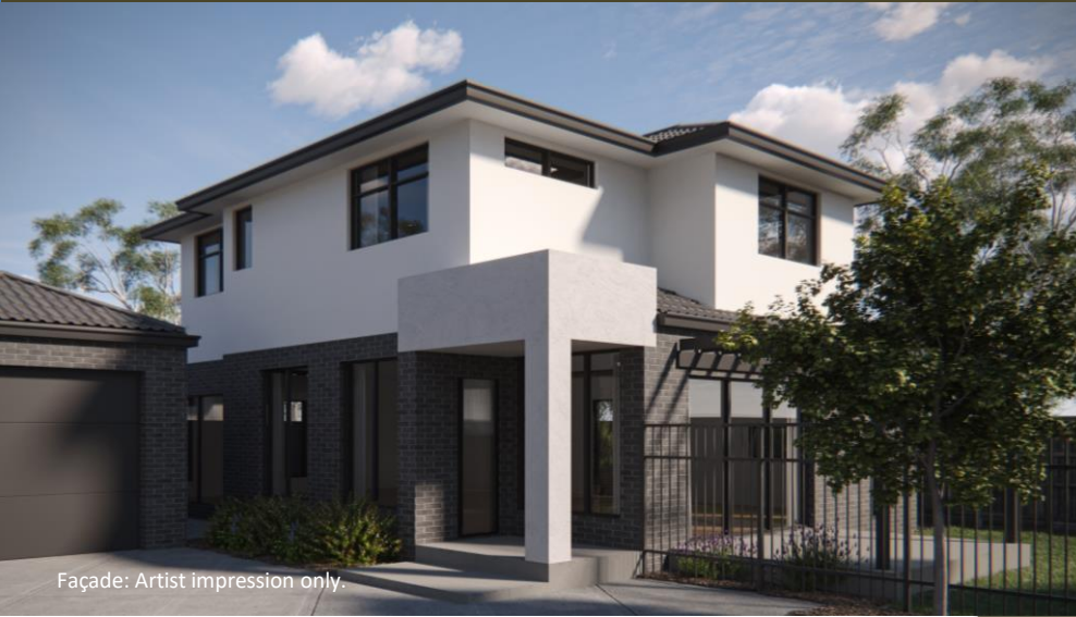
Façade: Artist impression only.