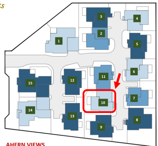
AHERN VIEWS 74 Ahern Road, Pakenham

Disclaimer: The builder reserves the right to substitute the make, model or type of any of the above products to maintain the quality and product development of its homes. Changes may be made subject to Res Code requirements. Price and other information are subject to change without any notice. All plans and façades are indicative concepts and are not intended to be an accurate depiction of the building. All dimensions are approximate. Refer to contract documentation for details. Working drawings take precedence over brochure and may change subject to approval by relevant authorities. Always refer to council approved plans. Fixed site cost.