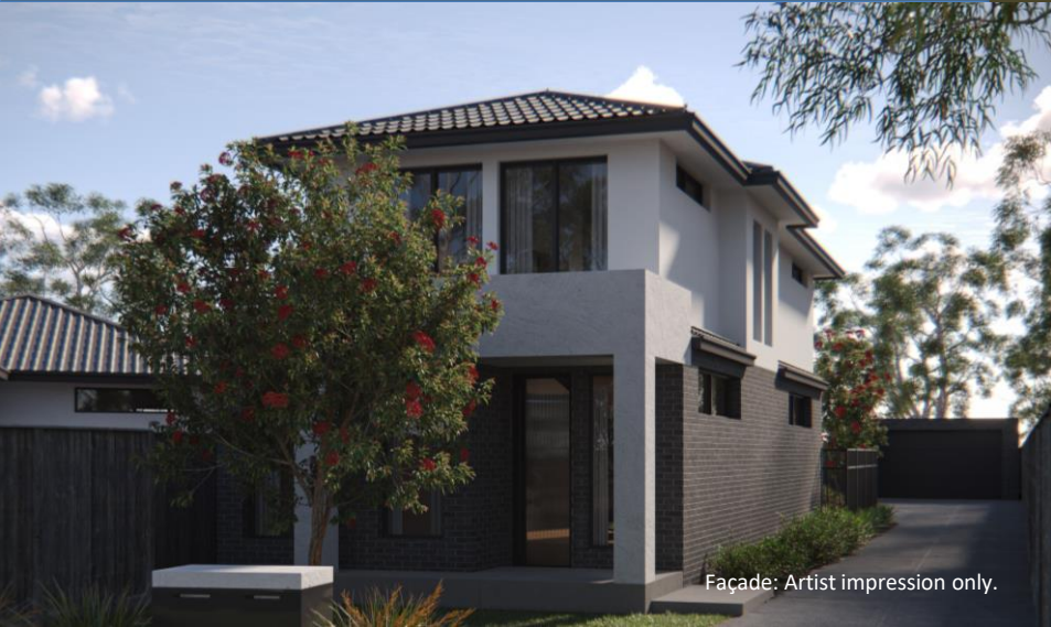
Façade: Artist impression only.